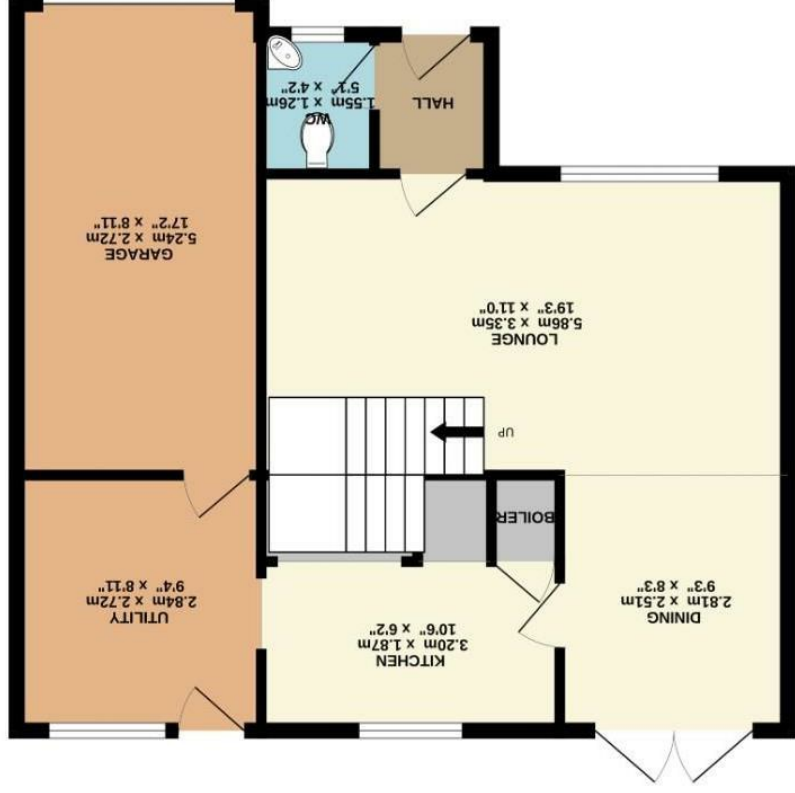
GROUND FLOOR (670 sq.ft.) approx.

Whilst every attempt has been made to ensure the accuracy of the floorplan contained here, measurements of doors, windows, rooms and any other items are approximate and no responsibility is taken for any error, omission or mis-statement. This plan is for illustrative purposes only and should be used as such by any prospective purchaser. The services, systems and appliances shown have not been tested and no guarantee as to their operability or efficiency can be given. Made with Metropix ©2025